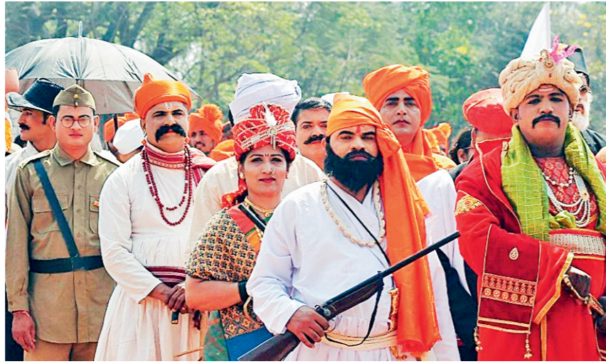
The officers and employees of Kolhapur Zilla Parishad dressed as prominent freedom fighters on the occasion of ZP's sports festival on Friday.