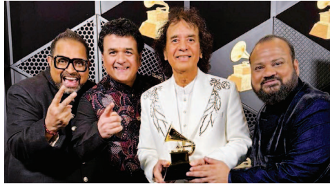
Ustad Zakir Hussain, vocalist Shankar Mahadevan, percussionist V Selvaganesh and violinist Ganesh Rajagopalan of Shakti pose with the Grammy Award for best global music album.

Indian music struck a chord at the 2024 Grammy Awards with five Indian musicians, including tabla maestro Zakir Hussain and flautist Rakesh Chaurasia, picking up the coveted prize at a glittering ceremony in Los Angeles. While Hussain was India's big winner with three Grammys, Rakesh Chaurasia picked up two. Singer Shankar Mahadevan, violinist Ganesh Rajagopalan and percussionist Selvaganesh Vinayakram, Hussain's collaborators in the fusion group Shakti, won one Grammy each at the event held at the Crypto.com Arena. Shakti won the 2024 Grammy Award for best global music album for "This Moment". Hussain won two other awards -- the best global music performance for "Pashto" and best contemporary instrumental album for "As We Speak".