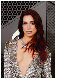
Dua Lipa was also seen at the 66th annual Grammy Awards

At the time of accepting the Award, Shankar Mahadevan said, "Thank you God, family, friends, and India. India, we are proud of you... Last but not the least, I would like to dedicate this award to my wife whom every note of my music is dedicated to." Mahadevan then dedicated the award to his wife and said: "I would like to dedicate this to my wife, whom every note of my music is dedicated to."